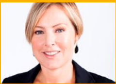
Gillian Tett, Financial Times