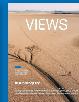
VIEWS 115grs Cocoon Silk paper