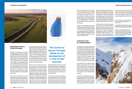
FEATURES 90grs RePrint paper