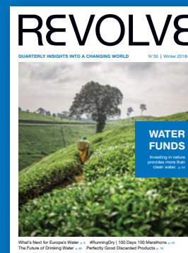
COVER 170grs Cocoon Silk paper