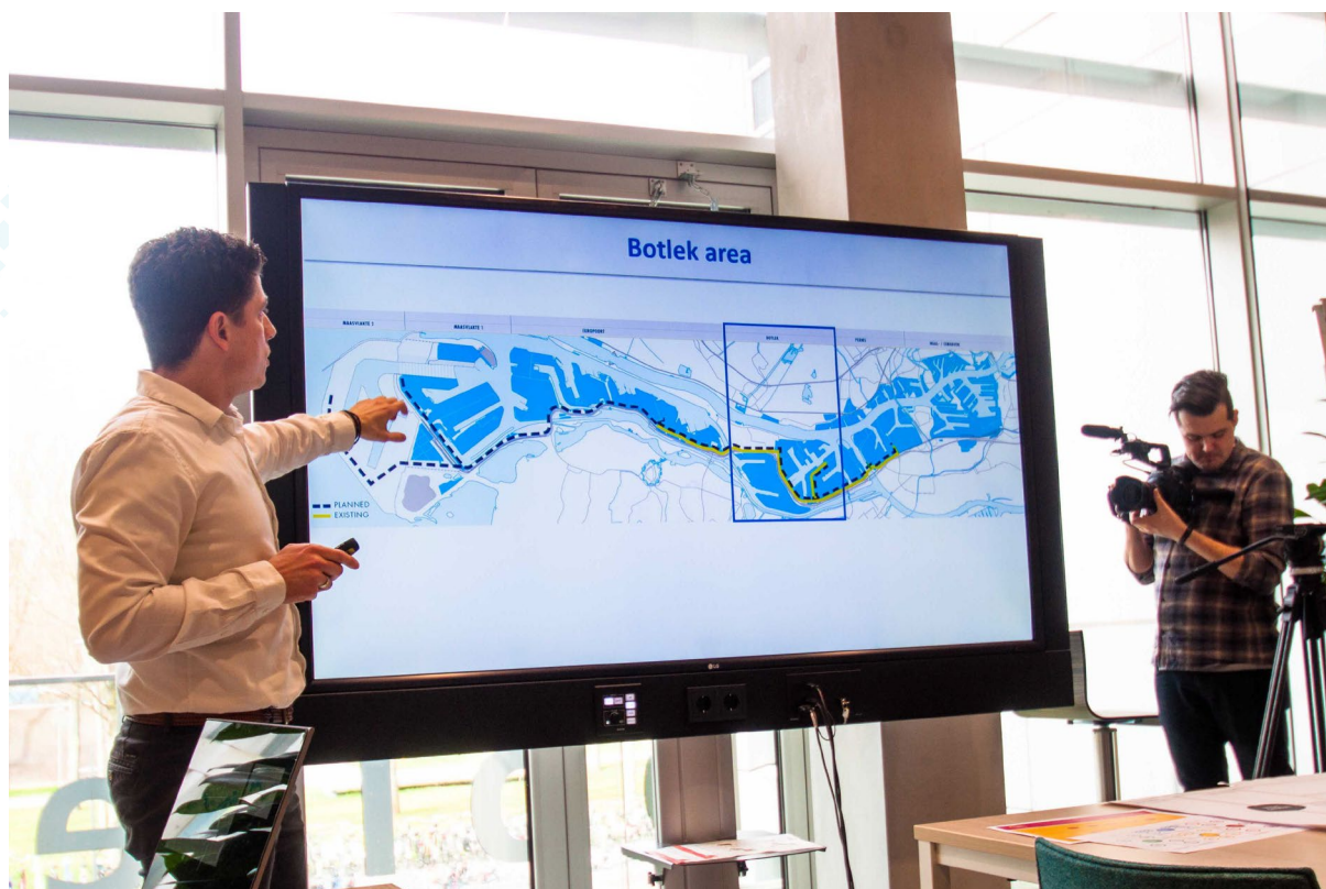
Figure 1: One of the presentations carried out in the first phase of the workshop