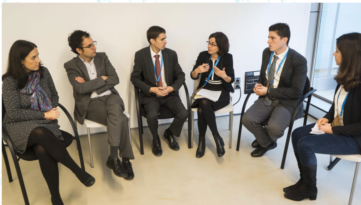
Figure 7: Third ZERO BRINE stakeholder consultation event

A brief summary of the event was demonstrated via this video that is share on the ZERO BRINE website as well as via ZERO BRINE social media channels.